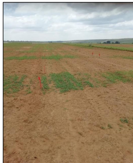
Photo 1: Efficacy research trials to compare Pre-emergent herbicide formed part of the P05000023 project which came to a close during March 2020

Generic and brand name herbicides can furthermore differ from each other regarding the physical form of the active ingredient, for example where the elements of the molecules are arranged slightly differently with the s- and r- isomers of metolachlor being an example of the latter. S-isomeres are more active than r-isomeres, and will accordingly, if applied at the same concentration, be more effective than the r-isomere counterpart. McFalls et al. (2015) states that the generic product may have a cheaper price but may thus not include the same amount and quality of active ingredient as the brand-name product. More of the generic material may need to be used or more applications required in order to achieve an equivalent rate of active ingredient, thereby potentially eliminating whatever cost savings was realized at the initial purchase of the generic product.