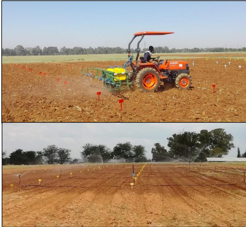
Photo 2: The efficacy of pre-emergent herbicides was previously evaluated as part of a larger grass control project (P05000023) which came to a close in March 2020.

control) as well as halosulfuron-methyl (Sevian - 50 g/ha), will be applied 3 weeks after the pre-emergence applications across all plots. Applications will be made with a CO 2 knapsack operated sprayer and boom (2.5m boom width - 4x 8004 teejet nozzles). The use of the knapsack operator unit, will allow for less space required to screen a maximum of 28 products. Products with similar active ingredients will be applied at the same rate in order to compare their efficacy. The lowest label rate will be selected for every product. Plots will be monitored every second week for a period of three months and the %control achieved as well as weed species compilation will be noted.