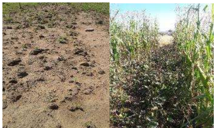
Figure 13: Maize and beans, 26/01/18 (L), Maize and beans 10/05/18 (R)