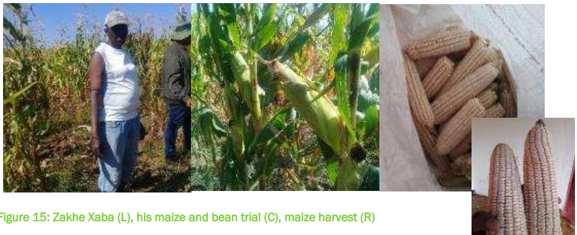
Figure 15: Zakhe Xaba (L), his maize and bean trial (C), maize harvest (R)