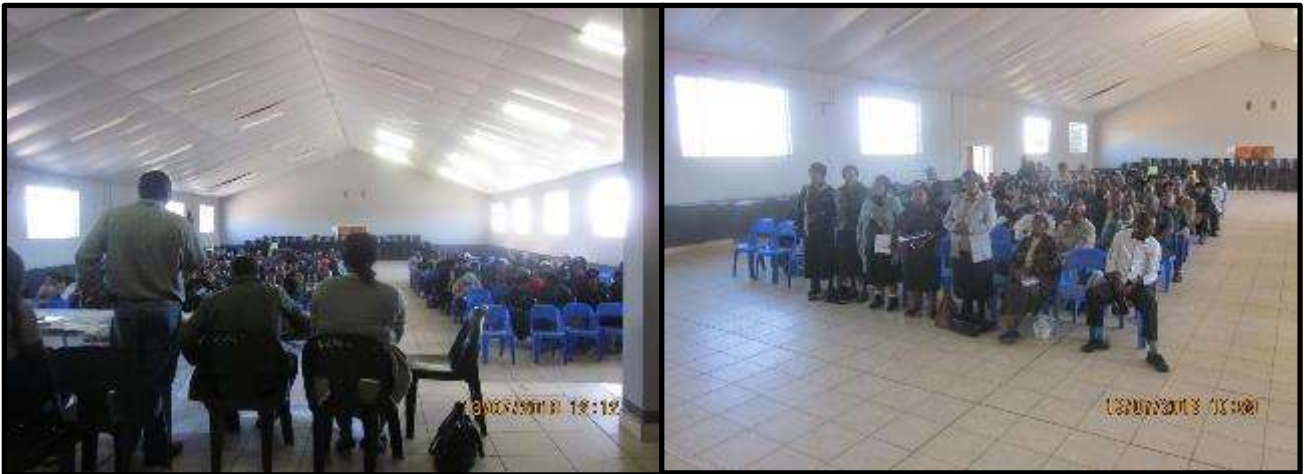
Figure 17: The Appelbosch meeting