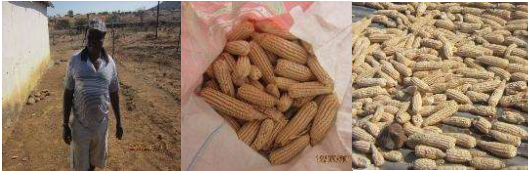
Figure 14: Mbuso Mkhize (L), Maize from control (C), maize from trial (R)