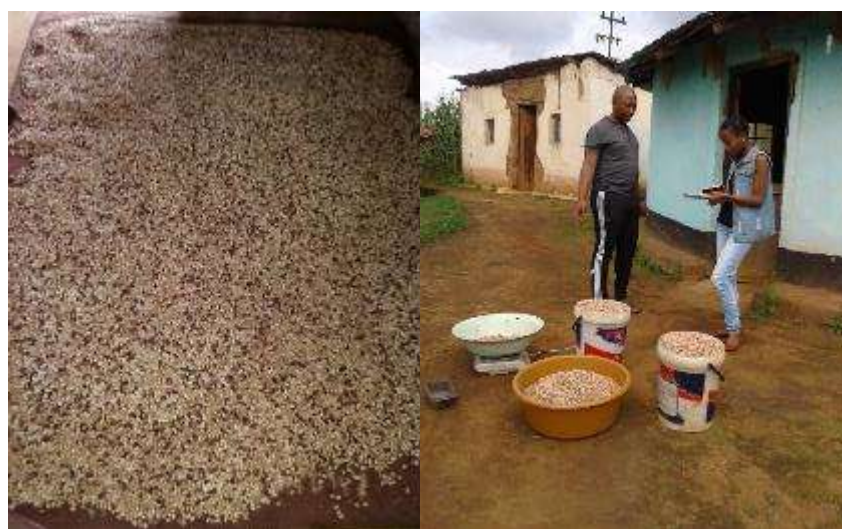
Figure 10: Dumazile Nxusa's beans from sole bean plot (l), beans from trial plot (r)

Dumazile, Khonzeni and Mathemba Nxusa are a close-knit family who rely on farming as the main livelihood. They undertook to plant the trial as a group as this is how they normally work. The three women grow maize, beans, amadumbe and sweet potato mainly for market and do most of the work themselves. The