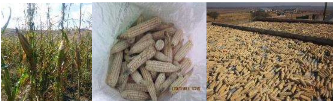
Figure 16: Moses' CA Trial (left), Maize from CA plot (centre), Maize from control plot (right)