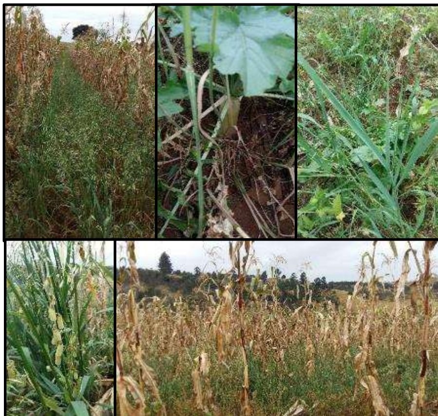
Figure 16: Views of Mrs Nxusa's cover crops in Swayimane

Dumazile Nxusa planted the cover crops in between her maize and the germination was 85%. All the cover crops germinated and are growing well. The area planted is 1460 m 2 .