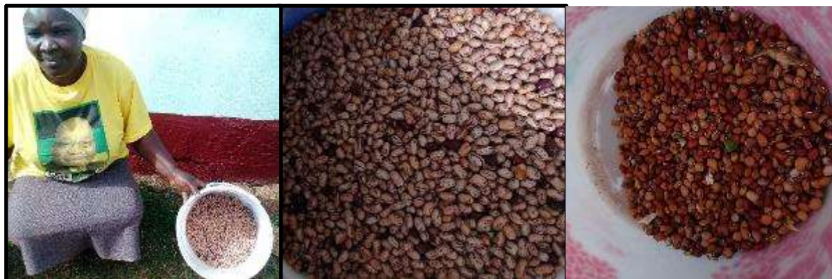
Figure 3: Khombisile Mcanyana, bean harvest from intercrop (left) and cowpea (right)