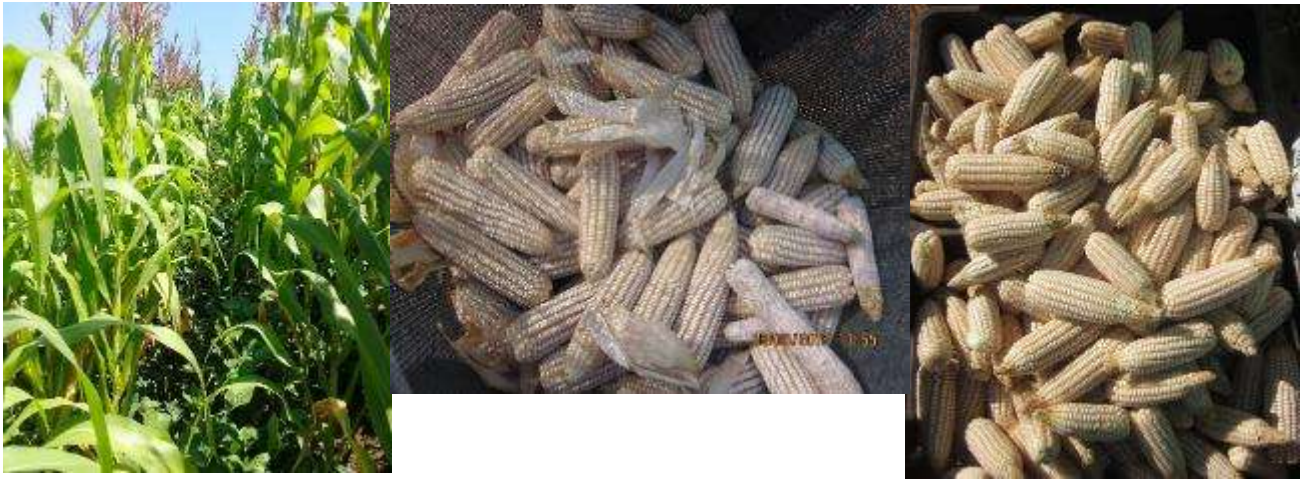
Figure 13: CA Trial (l), Maize from bean intercrop (c), maize from cowpea intercrop (r)