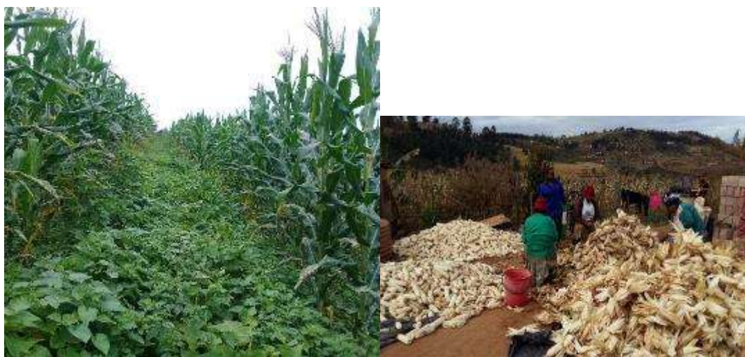
Figure 12: Maize and bean intercrop plot (l), Mam Nxusa and her sisters processing maize after harvesting (r)