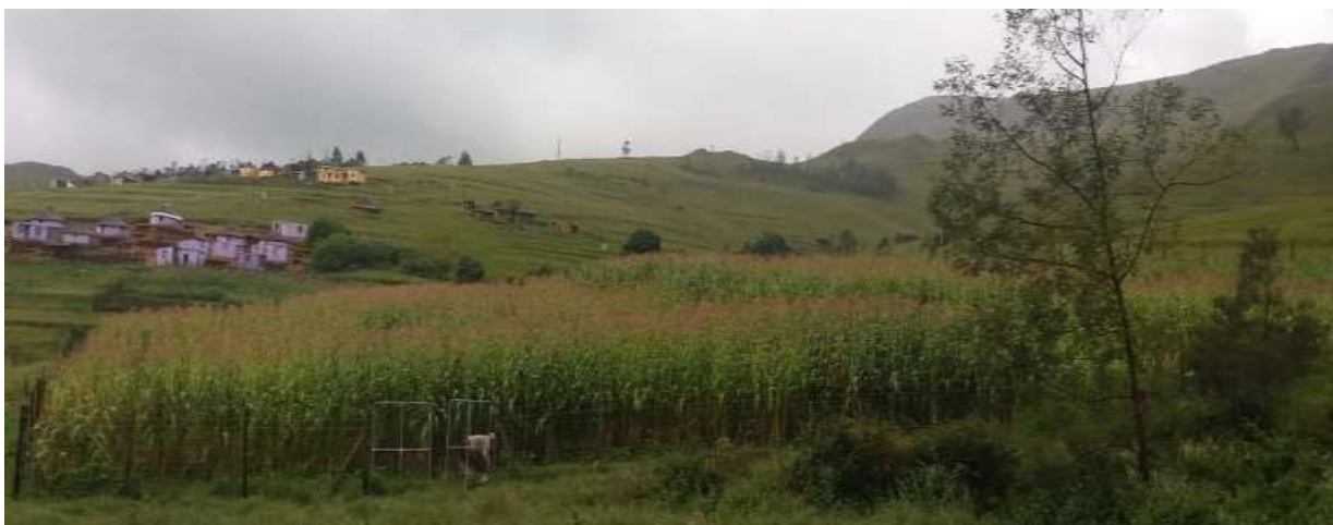
Above and right: Growth of the trial plot in Nkandla in March 2017.