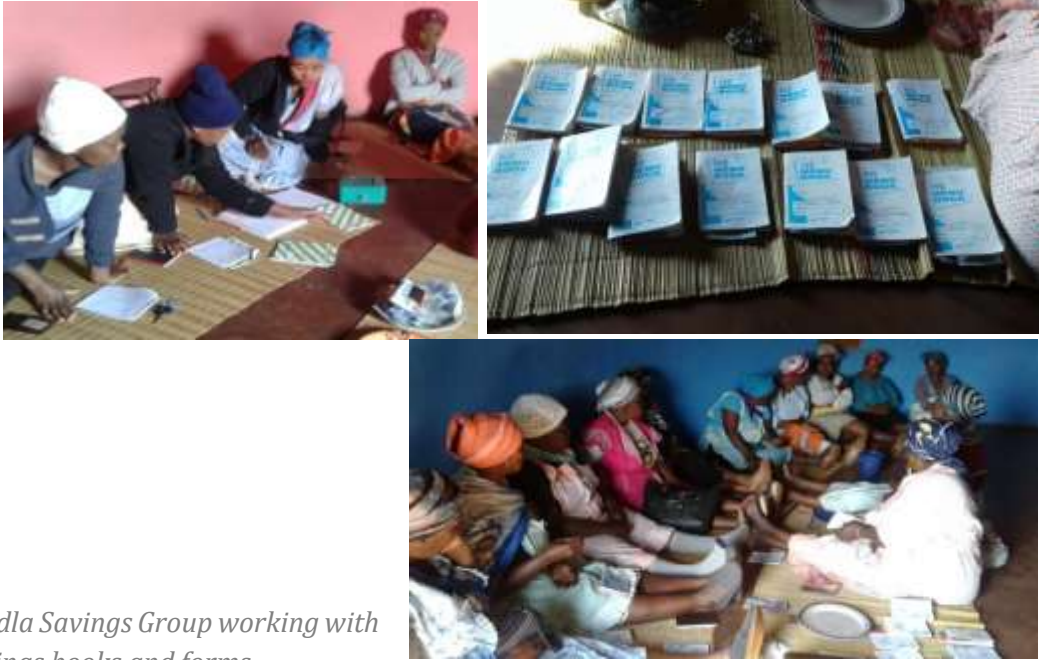
Right: Nkandla Savings Group working with the new savings books and forms