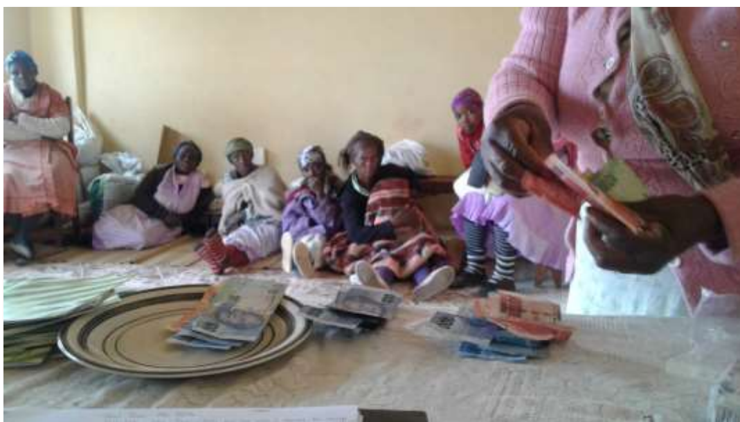
FIGURE 5: EZIBOMVINI, UKUZAMA FERTILISER SAVINGS GROUP

There are two savings groups in Ezibomvini, one for general household needs and another (Ukuzama) for the purchase of fertiliser. The groups have 23 and 10 members respectively. In both groups, the payment period is 6 months rather than the prescribed 4 months. The reason was that most members would not be able to pay back the loan in 4 months as the period was too short. Secondly, the group saves between R100 and R 300 a month instead of R 100 to R500, because they could not afford to save more than R 300 a month. In the first group, all three keys are kept by one person as one of the key bearers left the group. The members of the learning groups agreed to have two separate groups as there were people who wanted to join the savings group but weren't under the CA programme. The groups are in their second year of operation.